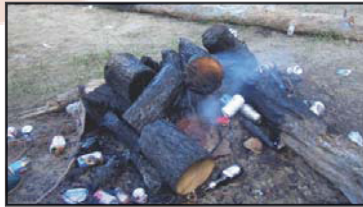
Trash found on Crown Land

Thanks also go to the Marine Patrol for their unending work to keep our beautiful piece of paradise looking that way. In addition to taking water samples throughout our area the Marine Patrol serves as stewards for Georgian Bay Land Trust properties in the area and does a lot of clean up on Crown Land as well.