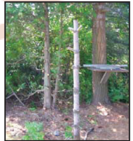
Trees stripped for firewood

Unfortunately some users of Crown Land don't seem to value the treasures that they have; the Marine Patrol found stripped live trees and continued to find quite a bit of trash. They cleaned up so that the next picnicker or camper might enjoy nature at its best.