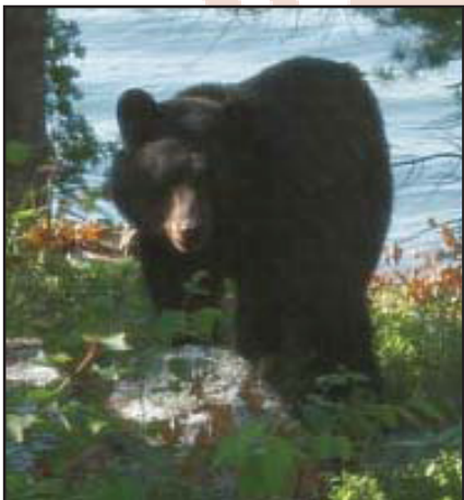
We live in the bears' backyard

As reported this month in the national media in Canada, this summer was unusually wet and wild berries were not as plentiful as in other years. As a result, there has been far more black bear activity close to humans all over Ontario and Quebec this year.